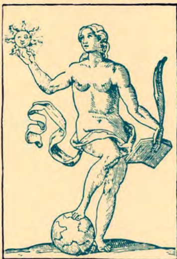
A personification of truth, Iconologia , Cesare Ripa, 1593.

Cosponsors: Advisory Committee on Women's Studies; WISEST; Women's Program, Faculty of Extension; Voice of Women; UNDO; AWA.